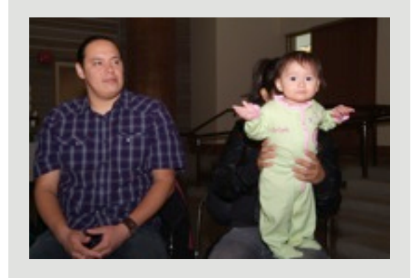
(Winning Caption Here)

Submit a caption for the following picture to nitep@interchange.ubc.ca. The winner will be revealed in the next issue.