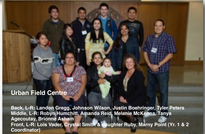
Urban Field Centre