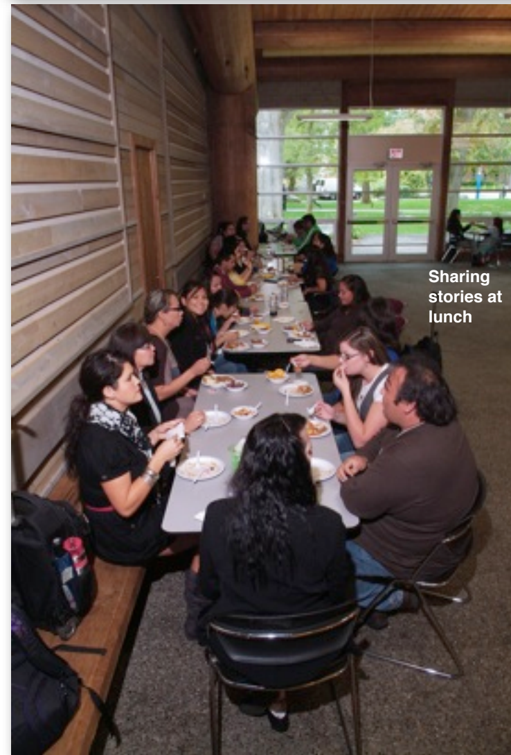
Sharing stories at lunch