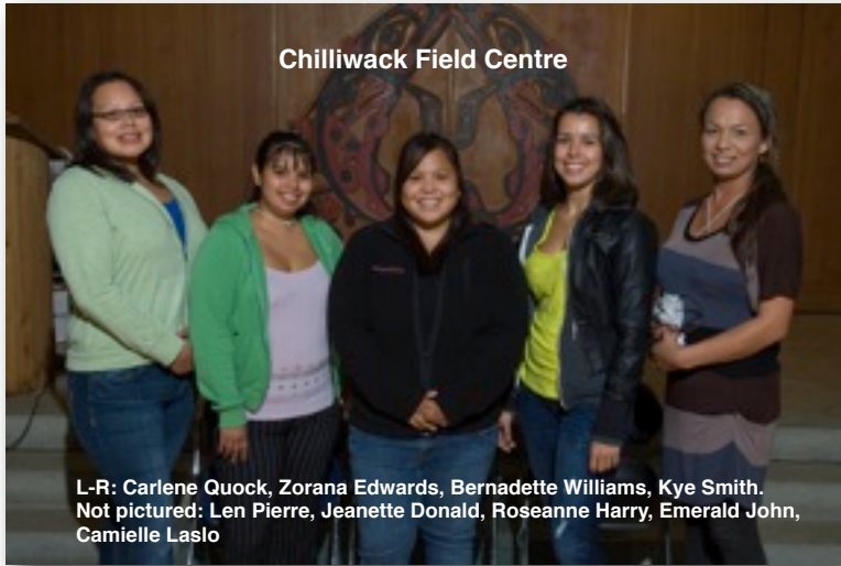
Chilliwack Field Centre

This year's gathering was held at the UBC Vancouver Campus on September 23, 2010