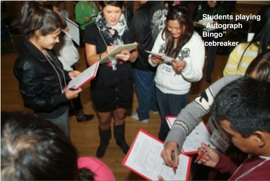
Students playing "Autograph Bingo" icebreaker