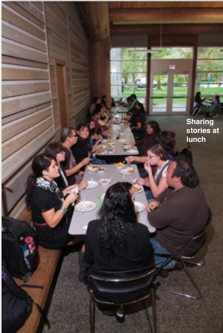
Sharing stories at lunch