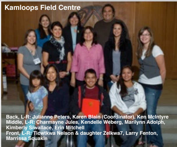
Kamloops Field Centre