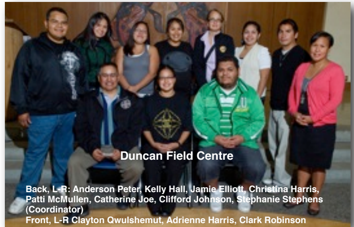
Duncan Field Centre