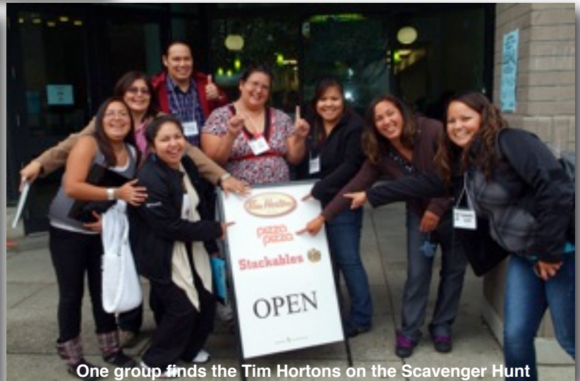
One group finds the Tim Hortons on the Scavenger Hunt