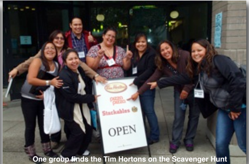
One group finds the Tim Hortons on the Scavenger Hunt