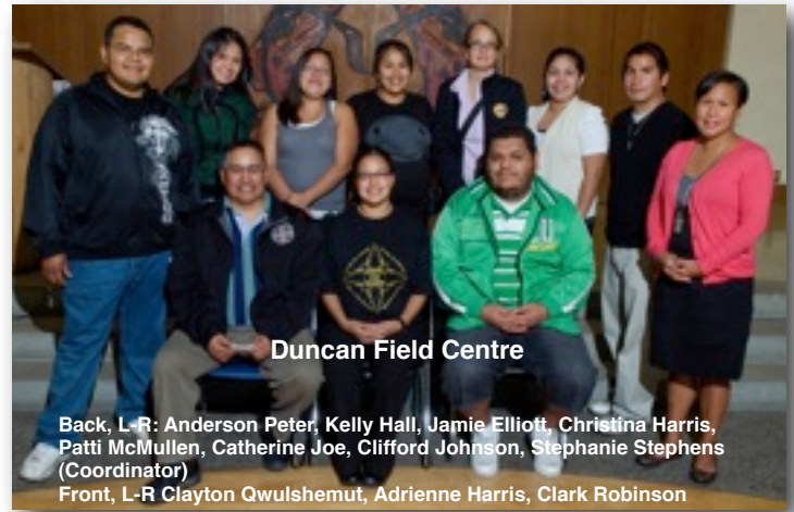
Duncan Field Centre