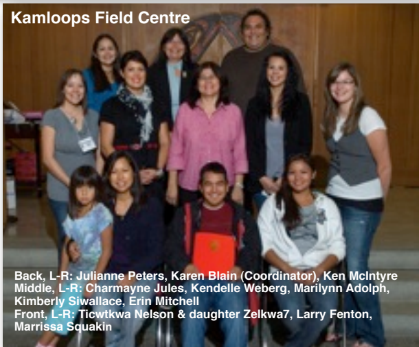
Kamloops Field Centre