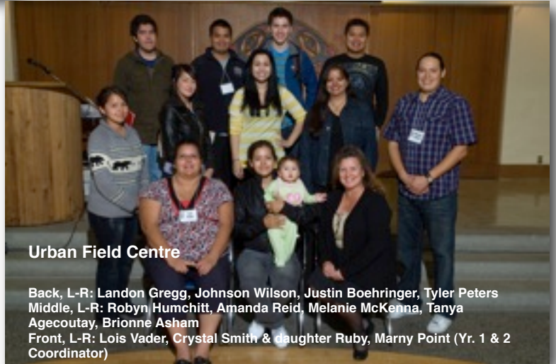
Urban Field Centre