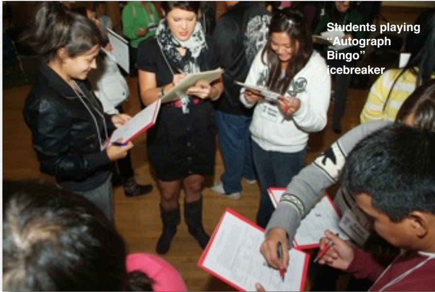
Students playing "Autograph Bingo" icebreaker