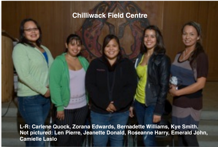
Chilliwack Field Centre

This year's gathering was held at the UBC Vancouver Campus on September 23, 2010